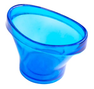
Figure 1 Typical Eyewash Cup Found at Your Local Drug Store